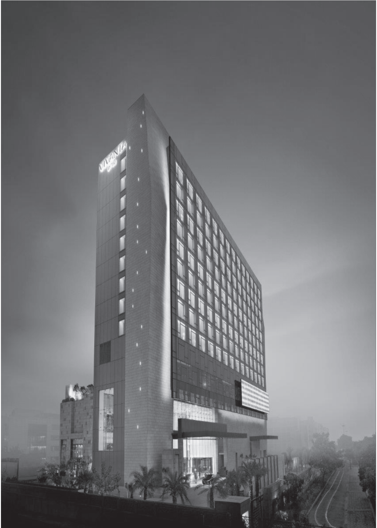
Company's Hotel Project- "VIVANTA BY TAJ - GURGAON, NCR" located at Plot No. 1, Sector 44, Gurgaon, Haryana